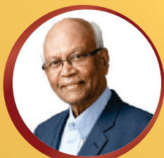
Padma Vibhushan Dr R. A. Mashelkar FRS, National Research Professor & President, Global Research Alliance