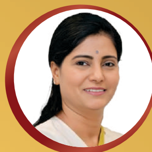
Smt Anupriya Patel Hon'ble Minister of State for Health & Family Welfare and Chemicals & Fertilizers, Government of India (Invited)