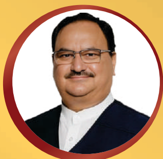
Shri Jagat Prakash Nadda Hon'ble Minister for Health & Family Welfare and Hon'ble Minister for Chemicals & Fertilizers, Government of India (Invited)